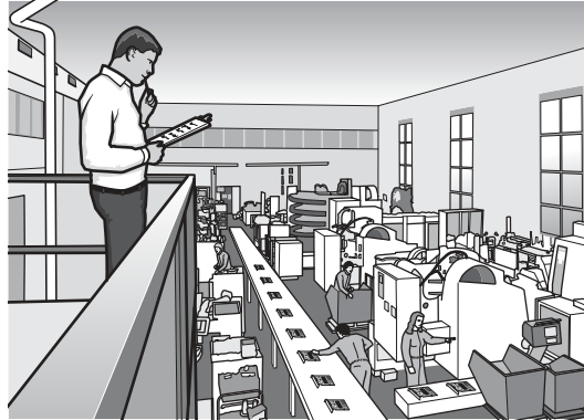
Fig. 4.1 'getting on the balcony'